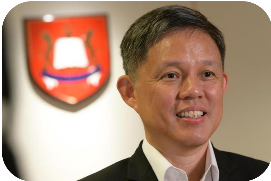
Mr Chan Chun Sing Minister for Education