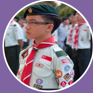
CCA Option Form