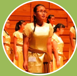
CCA Experiential Week