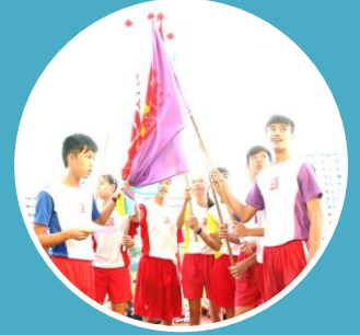
CCA Allocation Exercise