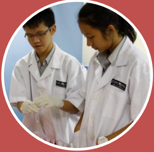
CCA Display Day